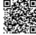
Shorten a String

Setting up for stringing: https://www.youtube.com/watch?v=bz3oI3h42Sk